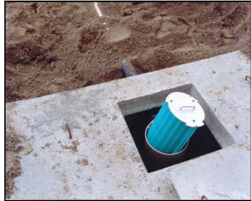
Zabel Effluent Filter (Living by Water Workshop In A Box presentation)

Effluent filters are easy to maintain. Once a year, slide the filter out and wash it off with a garden hose over the tank. Some filters even come with an alarm that sounds when they need cleaning. Effluent filters are highly recommended in order to prolong the life of septic systems.