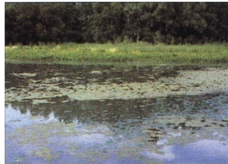
Excessive Weed Growth (Living by Water Workshop In A Box Presentation)

One of the biggest concerns is bacterial contamination of drinking water. Often, only a small amount of contaminated water can be extremely harmful. When ingested (through drinking water or when swimming), bacteria such as E. coli and Fecal Streptococci can cause serious health problems, and some strains are even fatal.