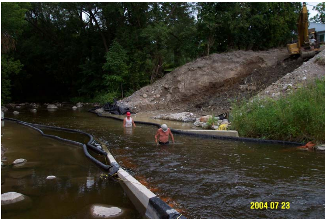
Above workers ensure that no sediment flows from the work site.

There is a wealth of information about working in and around water on the Fisheries and Oceans Canada website ( www.dfo-mpo.gc.ca/canwaters-eauxcan ).