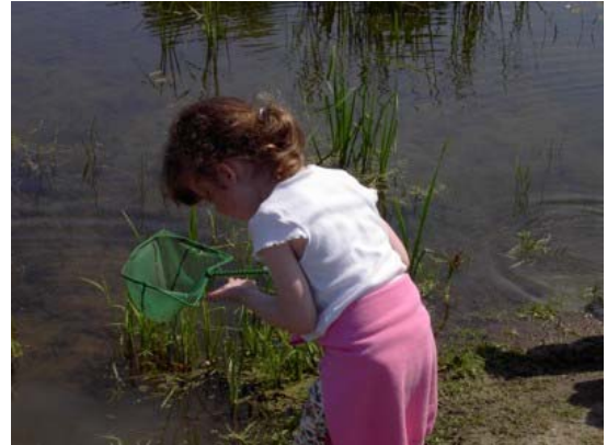
At the CRCA's environmental education programs, surfing the net takes on a whole new meaning.

But that doesn't mean that rural people always take advantage of having nature in their own backyard. Many of us take it for granted.