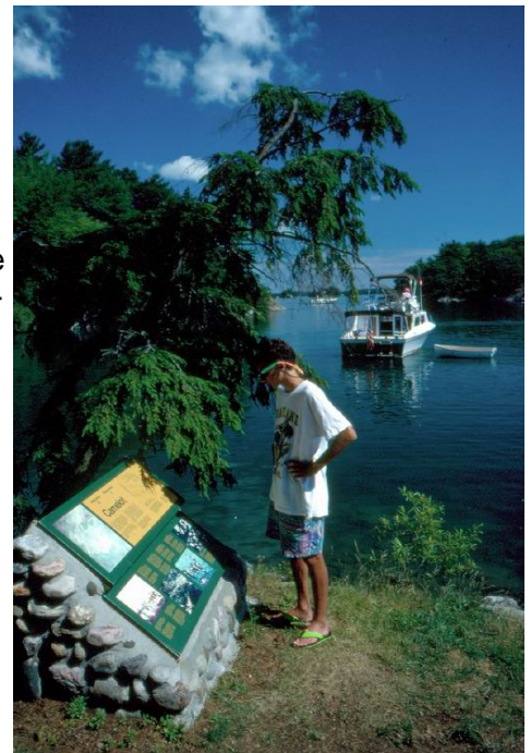
A summer visitor learns about the Park.